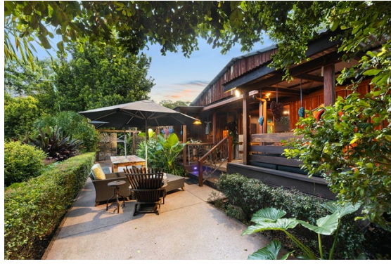
Billabong: Our Teaching Facility