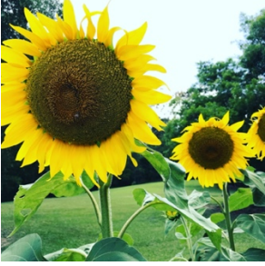
The role of colour, light & species selection